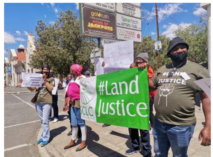
Southern Centre for Land Change (SCLC) in the Western Cape